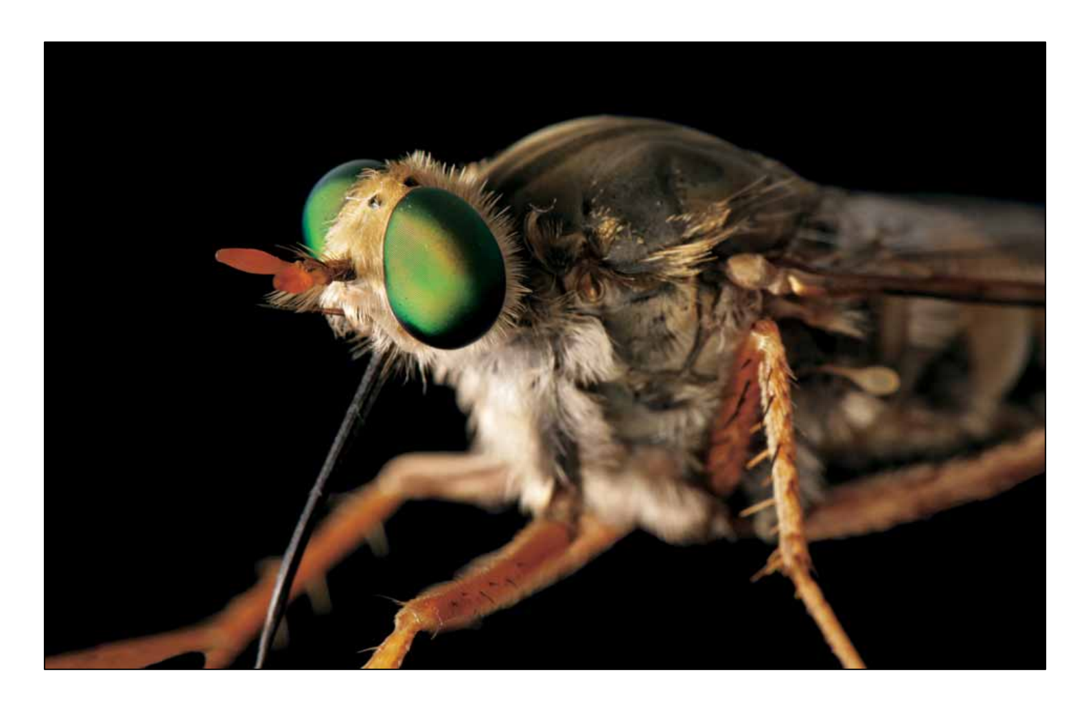
Delhi Sands Flower-Loving Fly Ontario, CA